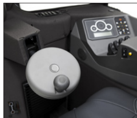
Midi steering wheel