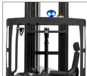
Blue point safety light