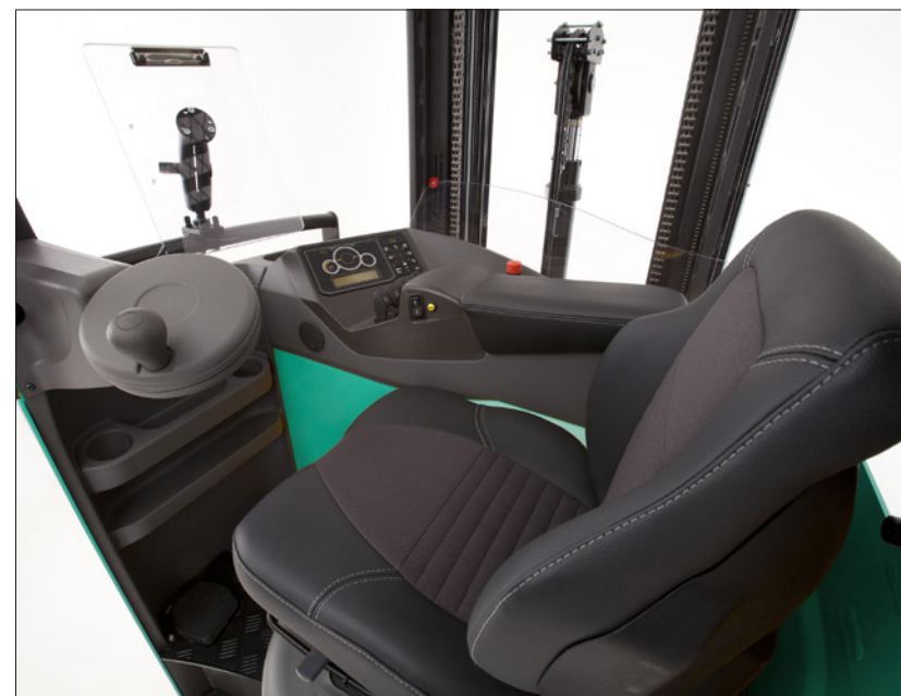
Midi steering wheel and fingertip controls

There is more information on RB12-14N3(L)(C) Series on our website