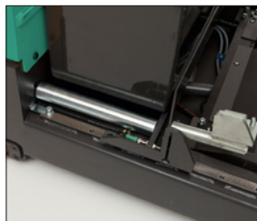
Battery on rollers