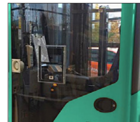
2-way intercom for cold store cabin