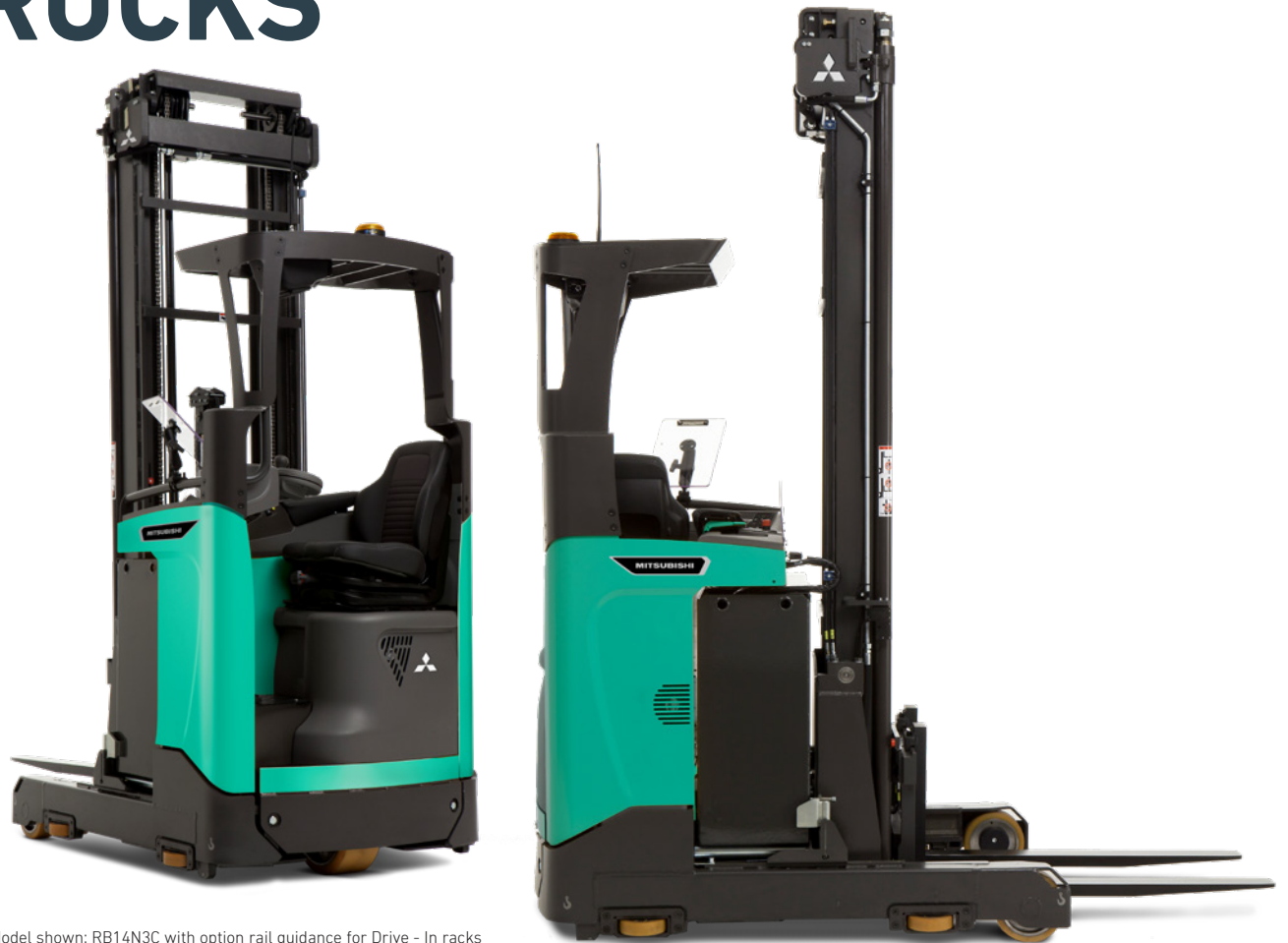
Model shown: RB14N3C with option rail guidance for Drive - In racks