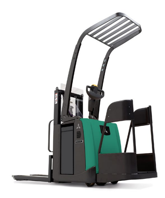
Overhead guard option