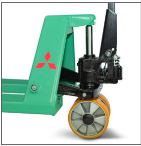
Controlled lowering valve